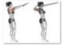
Resistance Band Face Pull