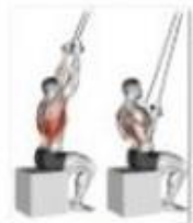
Resistance Band Lat Pulldown