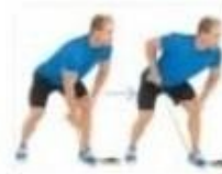
Resistance Band One-Arm Row