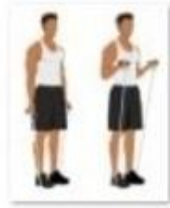
Resistance Band Biceps Curl