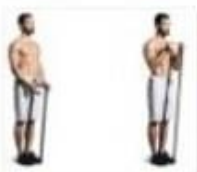
Resistance Band Hammer Curl