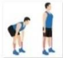
Resistance Band Romanian Deadlift