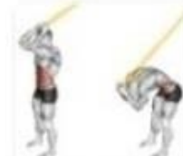
Standing Resistance Band Crunch