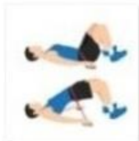
Resistance Band Hip Thrust Glute Bridge