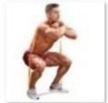
Resistance Band Squat