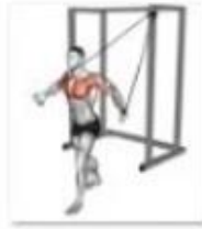
Resistance Band Chest Fly