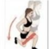
Resistance Band Reverse Lunge