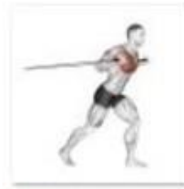
Resistance Band Chest Press