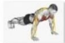
Resistance Band Push-Up