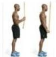
Resistance Band Triceps Pushdown