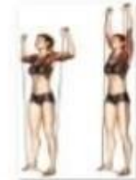
Resistance Band Shoulder Press